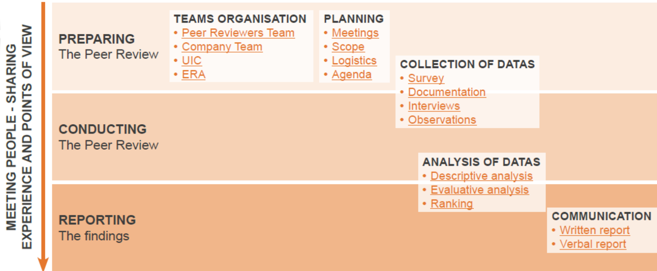
Figure 5 – Overview of the Peer Review process